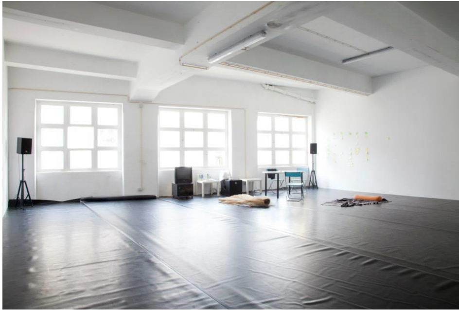
Photo 1 - Studio

Possibility of using microphone, tripod and video camera.