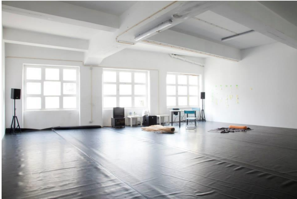
Photo 1 - Studio

Possibility of using microphone, tripod and video camera.